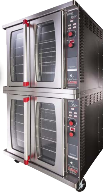
Model ECSF-ES2 shown