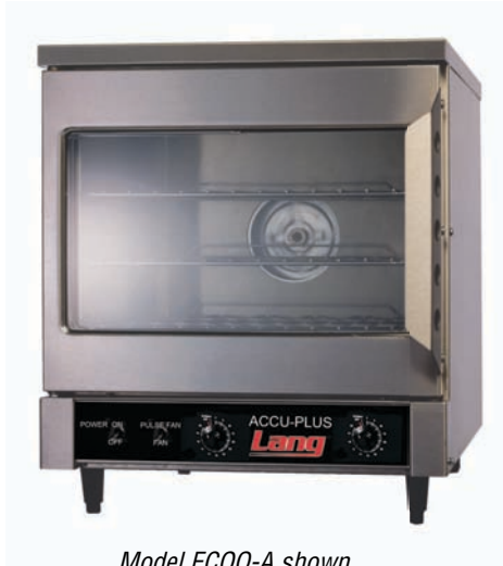
Model ECOQ-A shown