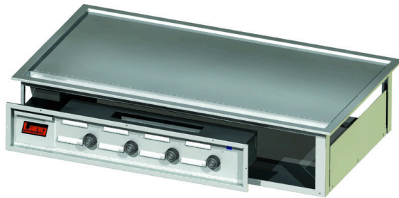
Model 148TDI shown