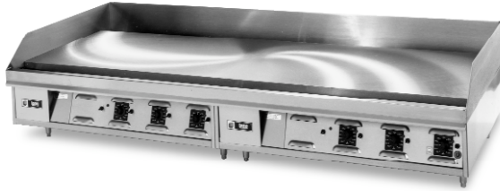
Model 172S shown