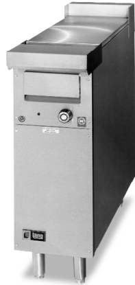
Model R12-ATG shown