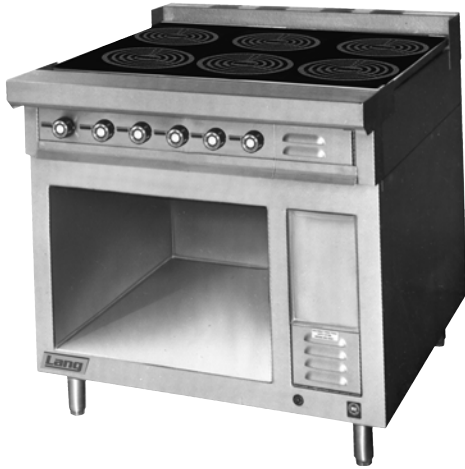
Model RI36B-ATE shown