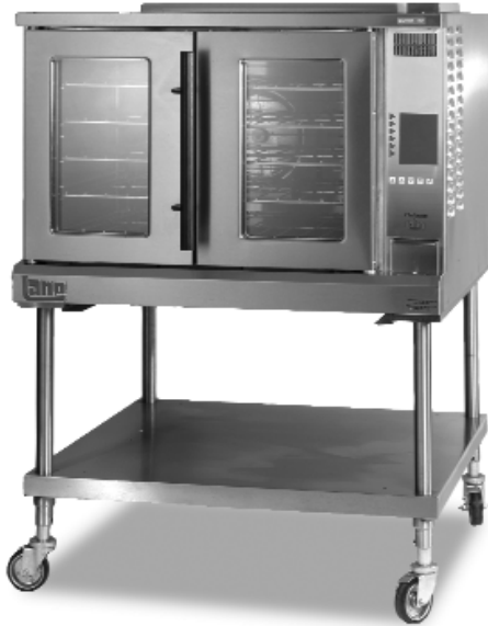
Model ECOD-PT2 shown, with optional 27" stand.